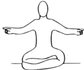
3C To this point