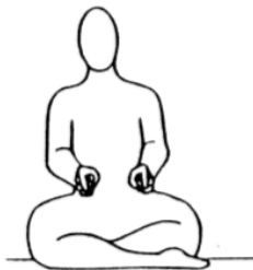
3A Starting position