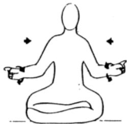
3D Circling inward