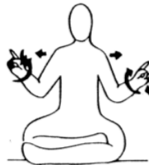
3B Circling outward