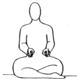
3E Back to the starting position